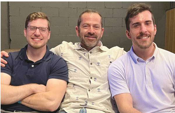
Rothkoff Law Group staff got together at Pinsetters Merchantville on Friday, June 23, 2023