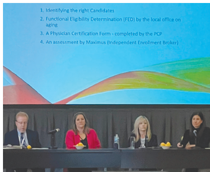
PAELA Conference in Bedford, PA, February 22-23, 2024