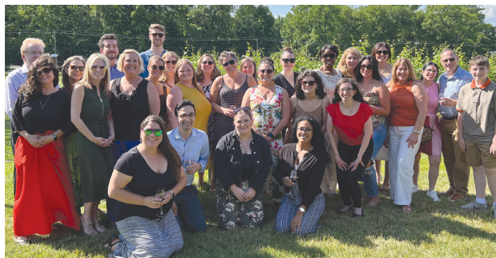
The Rothkoff Law team from both our PA & NJ offices recently got together at the recently opened Saddle Hill Winery in Voorhees, NJ.